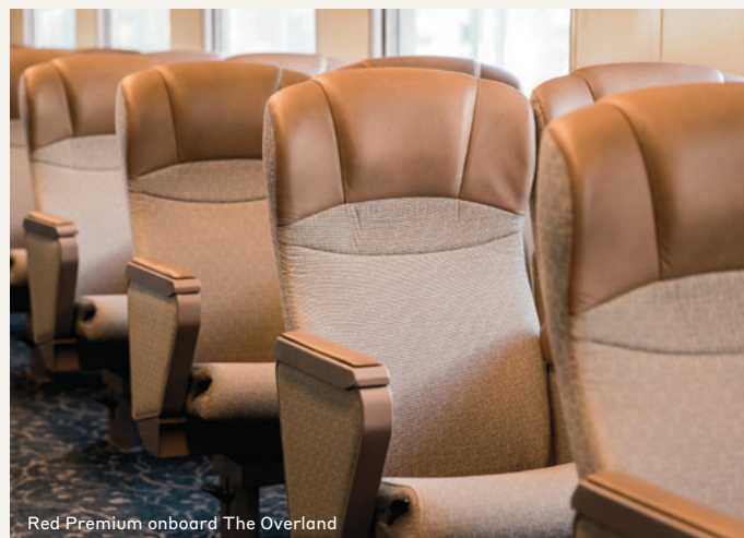
Red Premium onboard The Overland