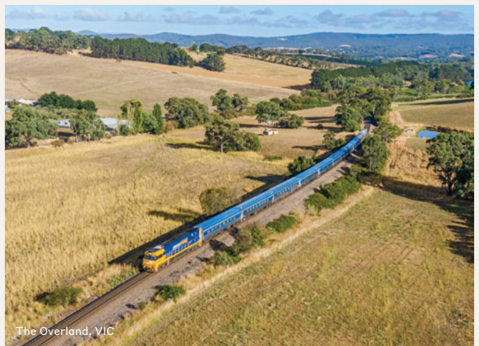
The Overland, VIC