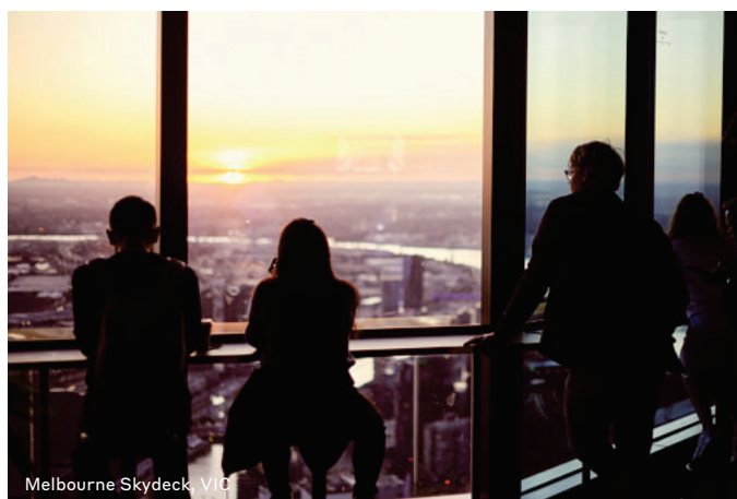
Melbourne Skydeck, VIC

The only thing better than taking in the sights, sounds and colours of our favourite city is doing it from Melbourne's highest observation deck. The best way to see it all.