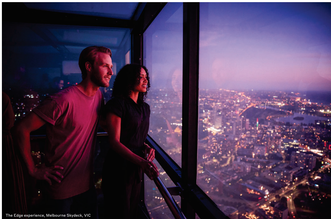
The Edge experience, Melbourne Skydeck, VIC

Standing proud at 300 metres tall, who could miss Melbourne's gold-plated Eureka Tower? Especially as Melbourne Skydeck at Eureka Tower has been transformed, revamped and innovated from ground floor all the way up to level 88.