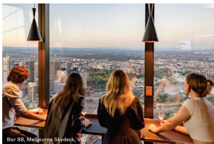
Bar 88, Melbourne Skydeck, VIC

At Bar 88, treat yourself to a coffee, snack or even a glass of wine surrounded by breathtaking views on our observation deck.