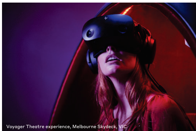
Voyager Theatre experience, Melbourne Skydeck, VIC

Skydeck's purpose-built Voyager VR Theatre, the only one in Australia, is here to show your clients its true potential. Strap in and prepare to be wowed.