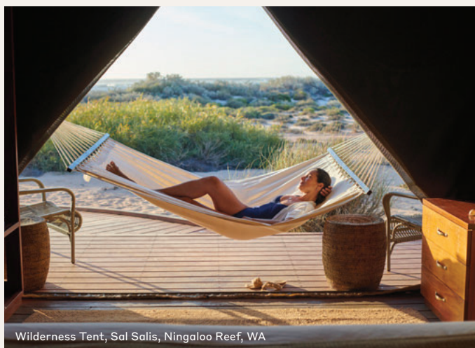
Wilderness Tent, Sal Salis, Ningaloo Reef, WA

Kayaks are the perfect vessel and your clients will be shown how to safely navigate the reef without impacting the ecosystem. Our guided kayak-snorkel tours go further offshore and drop anchor in the sand to explore the deeper lagoons. In Ningaloo Reef these are among the best snorkelling spots with soft corals, sponges, wobbegong sharks and marine fish galore. Also between August and October, and only metres from the reef, humpback whales migrating along this coast really are something to see.